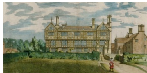
Broughton Hall, Eccleshall, Staffordshire